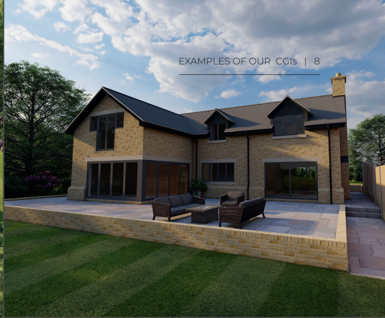
EXAMPLES OF OUR CGIS | 8

Large side and rear extensions and link to existing pool house.