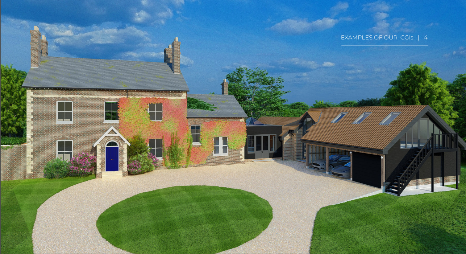
EXAMPLES OF OUR CGIs | 4

Internal images of any wall, opening etc. can be produced and all of the finishings and furniture can be edited to suit.