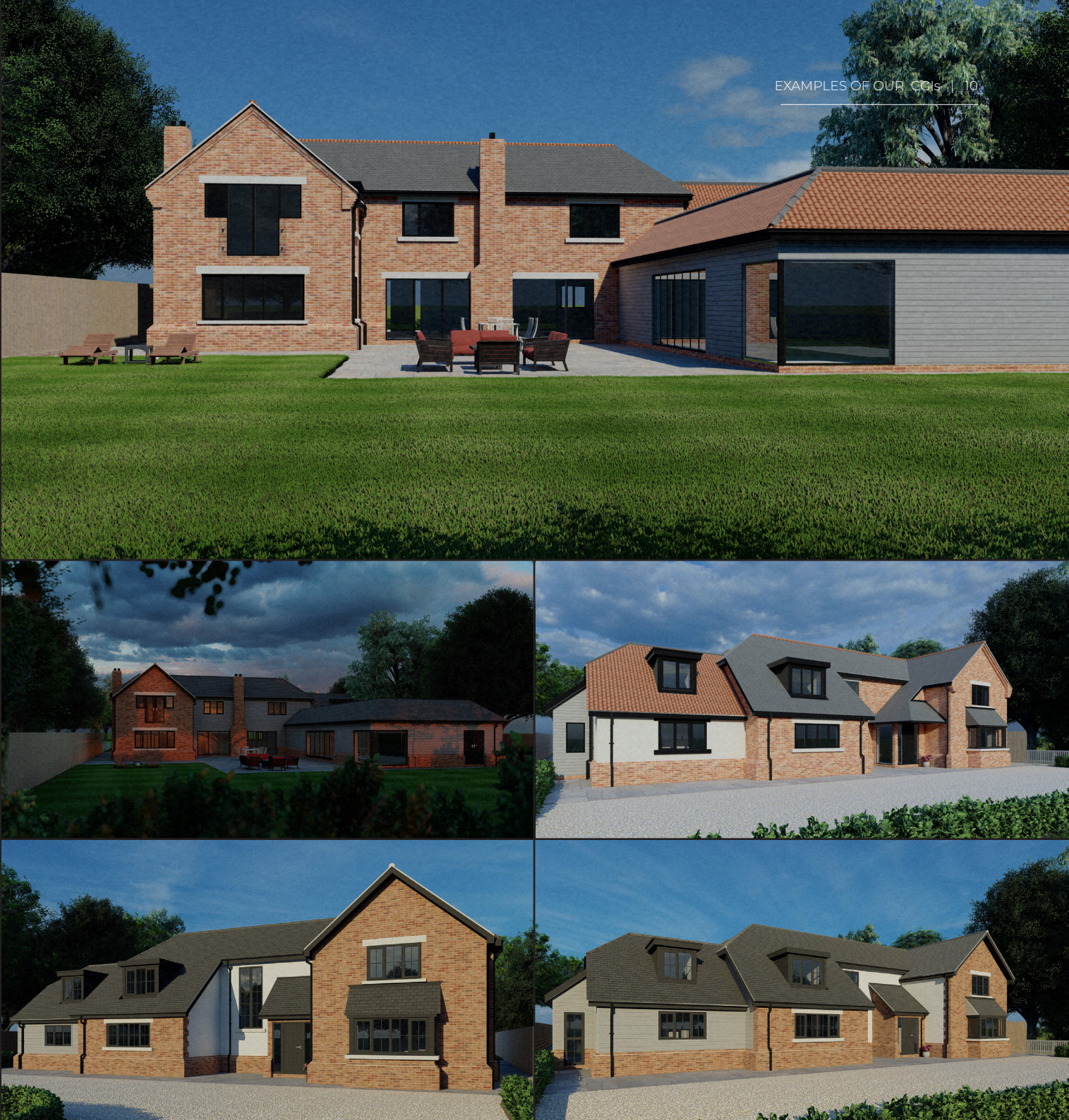
EXAMPLES OF OUR CGIs | 10

Bespoke design of family house in Cambridgeshire. Client has developed the design since planning was granted, and used our CGI images before making final decisions on the choice of materials, colours etc.