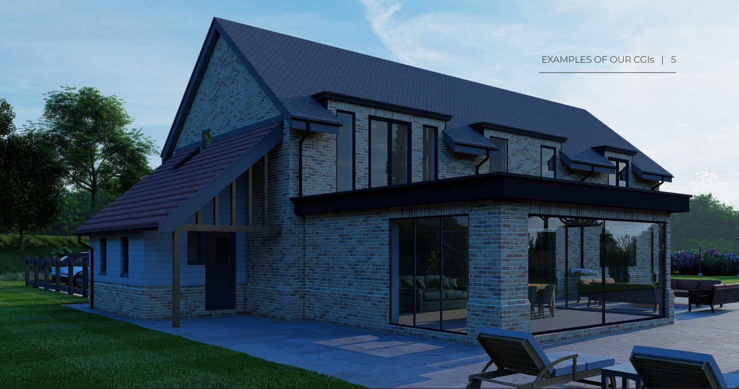
EXAMPLES OF OUR CGIs | 5

The software we use can help clients choose their materials.