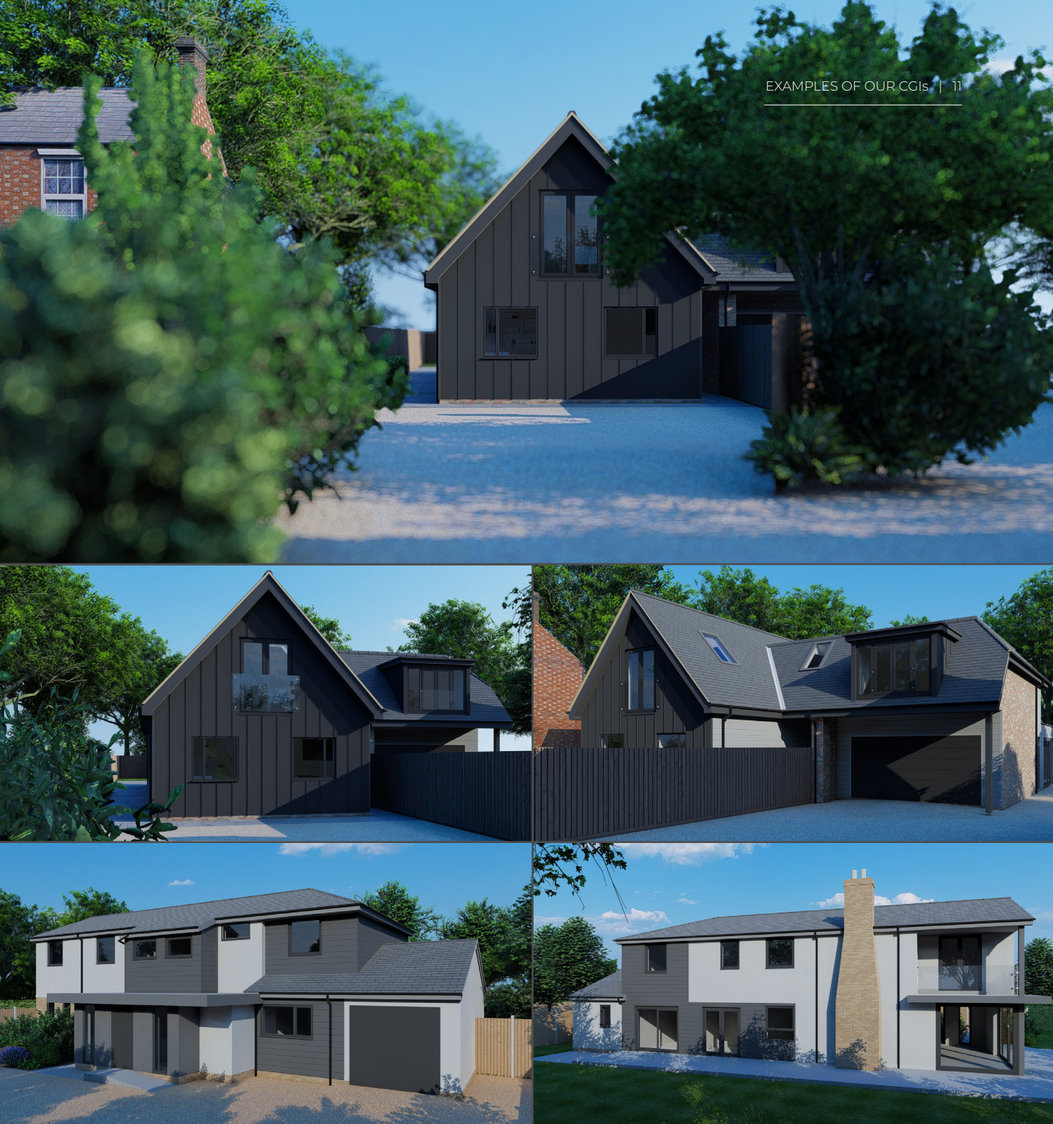
EXAMPLES OF OUR CGIs | 11